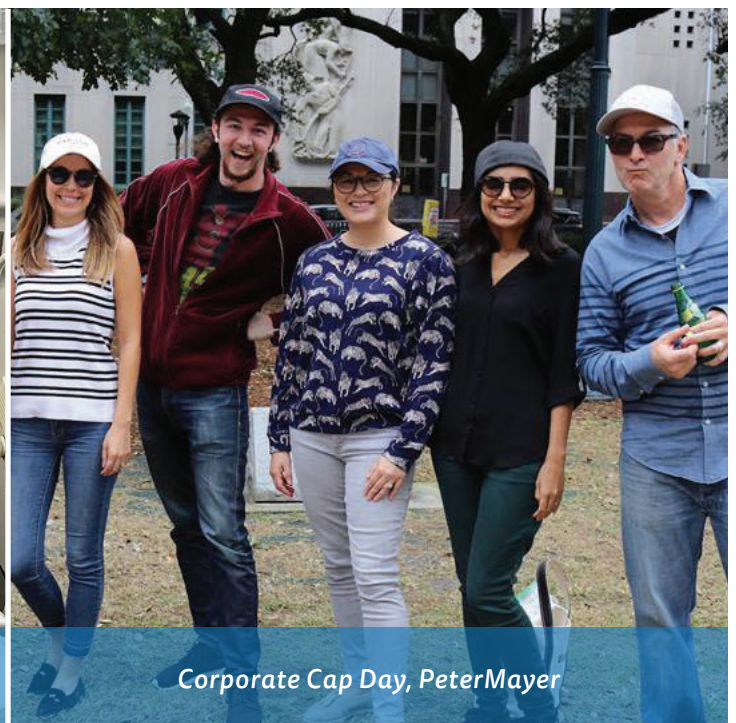
Corporate Cap Day, PeterMayer